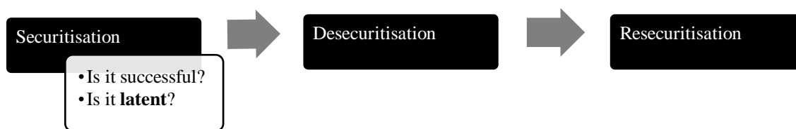
Figure 1. Securitisation, Desecuritisation and Resecuritisation

securitise an issue, it absolutely requires the de-existentialisation of threats (Bechtle, 2019). In Indonesia's case, the IUU fishing has been happening and it is still happening, thus it cannot be de-securitised for now. To differentiate between the concepts in the previous literatures, I create a brief figure below. I think Securitisation, Desecuritisation and Resecuritisation are three different processes, while the latent securitisation is under the Securitisation theory.